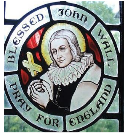
St John Wall

This week sees the Memorials of two sets of martyrs from our diocese who were, apart from one, martyred elsewhere. St John Boste (left) was born near Appleby in Westmorland, and was, for a time, the most hunted priest in the north of England. Denying treachery at his trial, he declared: 'My function is to invade souls, not to meddle in temporal invasions.' St John Wall (right) was born in Preston. He was ordained in 1645, and after working in the English missions, he became a Franciscan. At his trial, he refused to reject his faith to save his life. At his execution the Sheriff cried 'Will this end Popery? This is the way to make us all Papists!'. The 19 th July is the date for the Martyrs of Lancashire; 24 th July for the Cumbrian Martyrs.