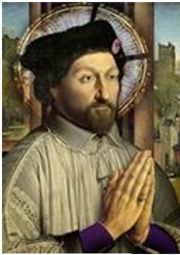
St John Boste